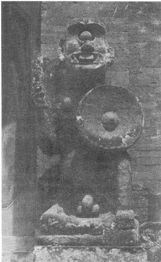
Figure 3: Ancestor statue in Pura Dalem, Celuk, Gianyar

the island (Table 1). All such statues are preserved in temples, except for those from Buleleng. Tentatively, I suggest that the functions of the statues are connected with the following activities: