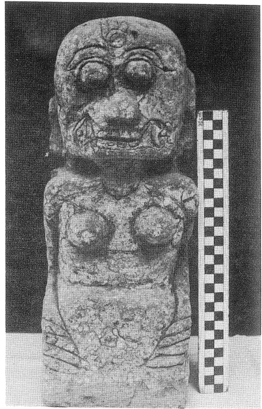
Figure 4: Ancestor statue in Pura Penataran Keramas, Banjar Kawan, Bangli