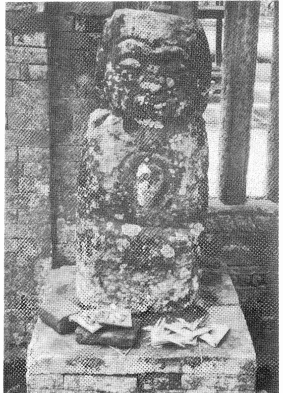
Figure 2: Ancestor statue in Pura Penataran Jero Agung, Gelgel, Klungkung

In Selulung, a mountain village in the western part of Kintamani, there are also a number of ancestor statues together with other megalithic objects such as upright stones and terraced platforms (Sita Laksmi 1985).