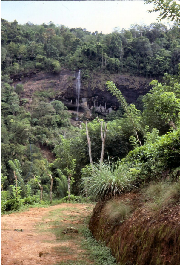
Figure 3. Fa Hien Cave at Pahiyangala.

In 1817-1818 the Vedda rallied with an upstart Sinhala insurrection led by Dorai Svami against the newly established British rule over the entire island, which had displaced the authority of the up-country Kandyan rulers. The rebellion crushed by the British military, eliminated the local aristocracy and Vedda influence. Following this, the Vedda groups declined throughout the 19th century. By the turn of the 20th century, they were considered to be on the verge of extinction (Seligmann and Seligmann 1911), or soon to be absorbed into the dominant Sinhala/ Tamil populations (Deraniyagala 1963; Dharmadasa and Samarasinghe 1990). In the mid-20th century Mahaweli River irrigation projects gave farmlands for the Sinhala population for expansion into the Vedda's life support regions. Where irrigation systems have been renovated and made available since the 1950s, thousands of Vedda have opted to resettle and engage in paddy cultivation and along with Sinhala farmers acquired land in the Mahaweli River plains.