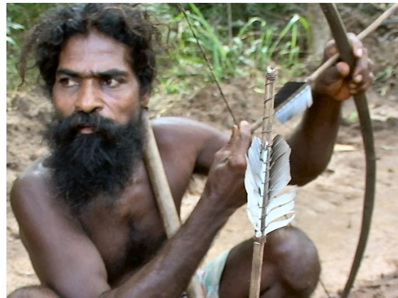
Figure 2. Sidubanda at Dambana, 2003.

My research with the Vanniyaletto communities, first introduced in 1973, and subsequently from 1975-1976 and in 1981 at Dambana, Mahiyangana, again conducted at Dambana in 2002-2003 (Figure 2) (see Blundell 2004, 2007, In Press), has revealed the following observations.