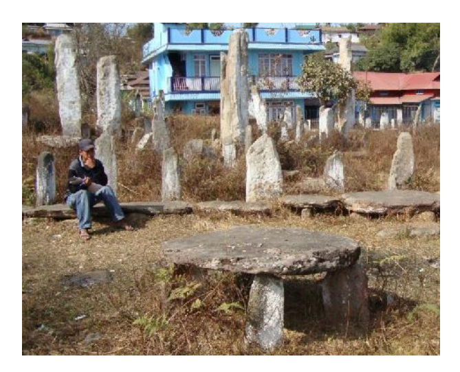
Figure 5: A group of clan stones in alignment in the sacred grove of lawnusiang