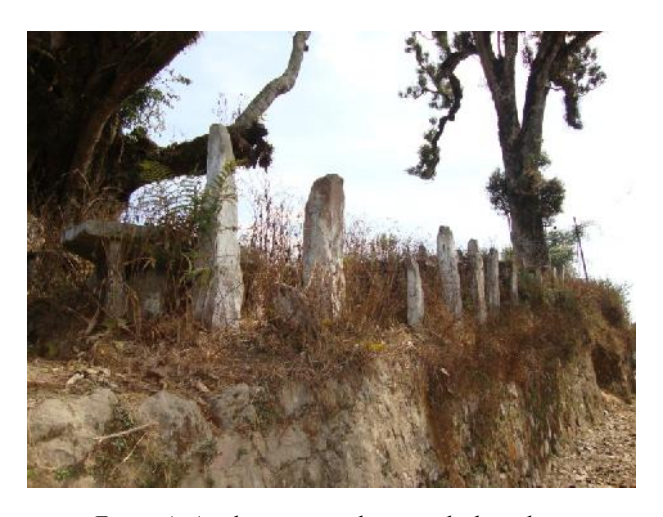
Figure 4: An alignment marking out the boundary