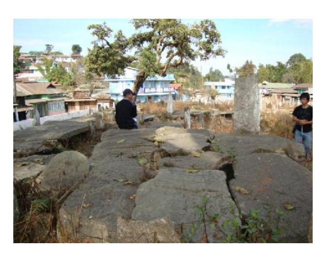
Figure 6: Stones for seating and resting