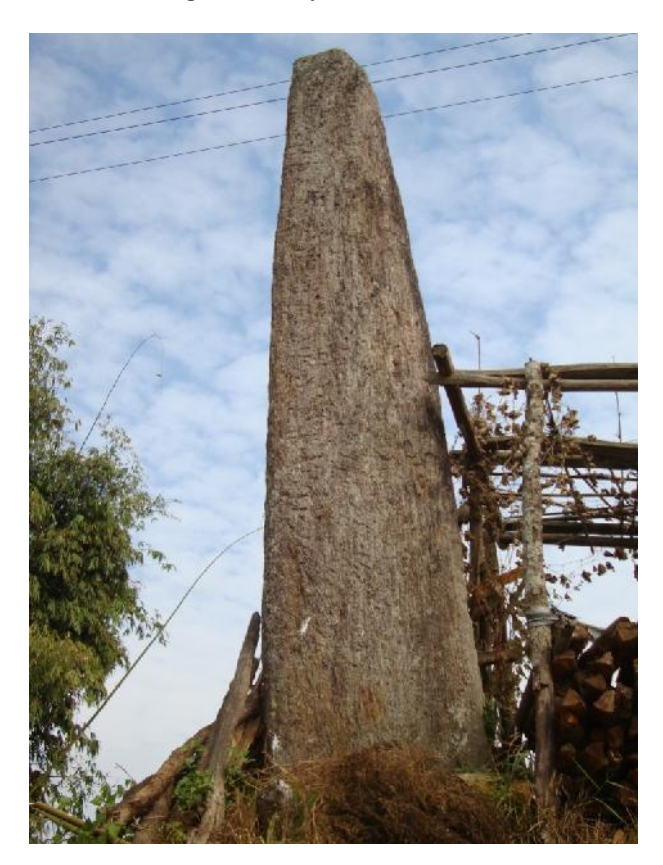
Figure 3: U-moothulelane, in memory of the victory over the "giant' of Nongjngi

menhirs found in the village include u-moothulelane (stone of thule lane), the tallest menhir found in Nangbah, at a height of 563cms (Figure 3); and moopyllaitsyier (stone where the cock is set free) at a height of 192cms located at Khlopano locality.