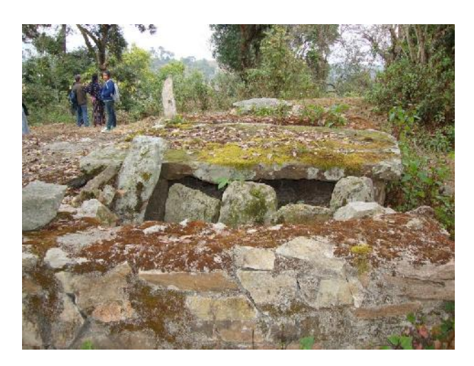
Figure 9: A clan cist where all ash and bones of all matrilineal kin are placed

(lyngdoh stone) in Iawmusiang morphologically a dolmen. This is a sacred stone where the lyngdoh (priest) performs rituals connected to village welfare during the festivals of Pam Iawmusiang and Knia Lyngdoh . Ramshyllong is another sacred stone located in Khlopano locality at whose feet animals are sacrificed on the occasion of village festivities. Moopyllaitsyier located at Khlopano is associated with death rituals in the case of women who die during pregnancy. In such cases, a cock is allowed to scratch the menhir. The death of women during pregnancy calls for this type of ritual so as to please the souls of both the deceased mother and the child.