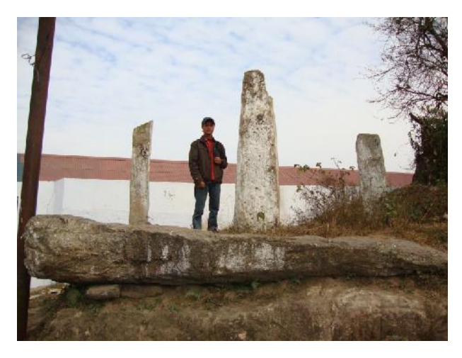
Figure 10: Khimdan, the tax collector's stone

stones or sitting stones where a weary traveller takes some rest during his journey from one village to another. However these are mostly one and the same though there are some stones in several corners of the village which are set up just for sitting.