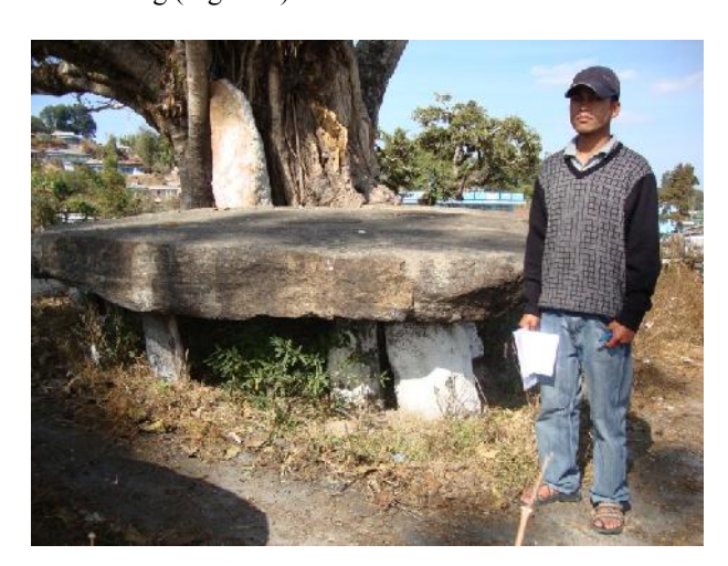
Figure 2: The stone of Sangap where the goddess of Iawmusiang

Thus the megaliths of Iawmusiang interestingly represent twelve clans of the village, and these are said to have been erected by ancestors during different periods of time. In the centre of these twelve clan stones lie a dolmen called sangap. The goddess of Iawmusiang is believed to reside here. As the legend goes Sangap, who hailed from the village had a wife at Shangpung and according to their visiting husband marriage system, he would visit his wife at night and leave early in the morning. Once when there were torrential rains, he asked his wife for a knup (rain shield made of bamboo and cane) but his wife jokingly told him to use a stone as cover. Sangap searched long and hard for a large, flat stone in the pelting rain and on finding one used it as a rain shield and carried it all the way to Nangbah. This stone was laid in the centre of the village and became the abode of the goddess of Iawmusiang (Figure 2).