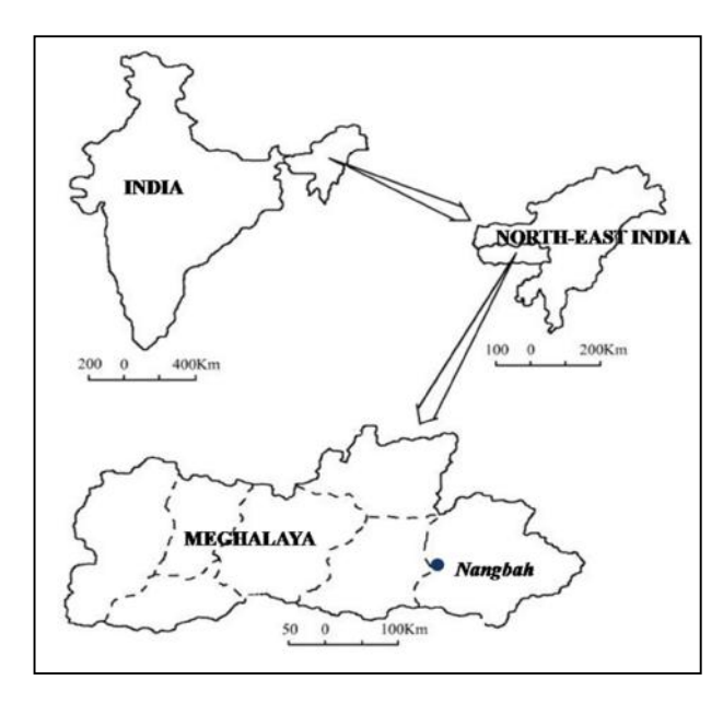
Figure 1: Map of India showing the location of Nangbah

1997) contended that megaliths were monuments used for astronomical observations.