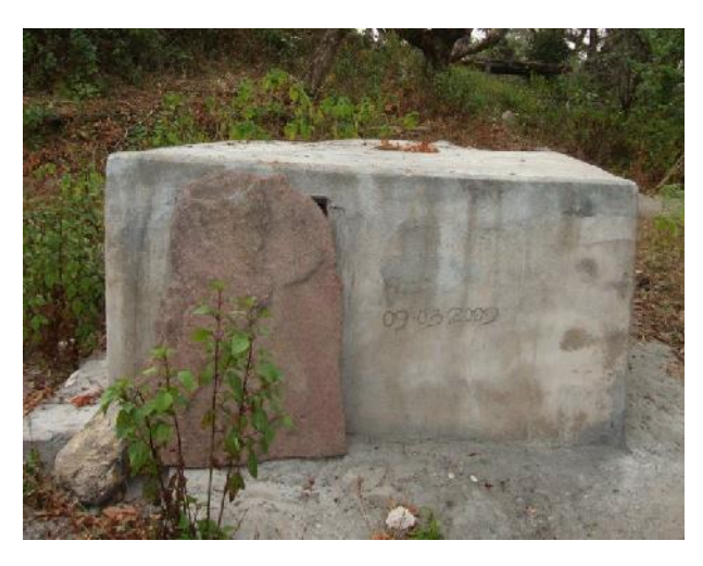
Figure 12: A cist renovated with cement and mortar

It is difficult to state with certainty when the megaliths in Nangbah were erected. However as many stories reveal, these were probably set up hundreds of years back. In recent times, no megalith has been built; instead some of the ones which had fallen down were re-erected and maintained, while others were renovated by cementing them with modern materials (Figure 12). Nevertheless, these structures from the past are still a part of the present day Jaintia society.