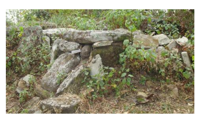
Figure 8: A family cist where ash and bones of the dead are deposited

These are directly associated with the post-cremation rituals including the disposal of remains of the deceased body. These burial chambers buried underneath, morphologically a cist, are of different sizes. The smaller ones of 182x213cms are family burial chambers (specifically moobuhshiang ), while larger ones of 304x365cms are clan burial chambers called moobah (Figures 8 and 9). These types of burials have a vertical wall on one side which acts as a doorway ( moolain ).