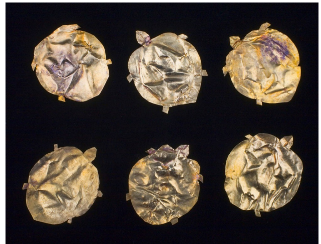
Figure 5. Images of tortoises found in Java. Museum Volkenkunde, Leiden, the Netherlands, inv. no. 1403.3200-3205.