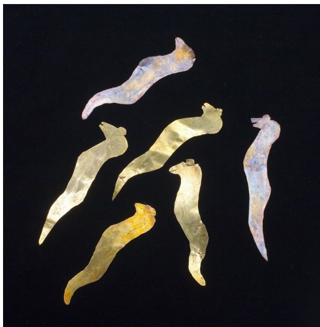
Figure 7. Images of snakes found in Java. Museum Volkenkunde, Leiden, the Netherlands, inv. no. 1403.3206-3211.