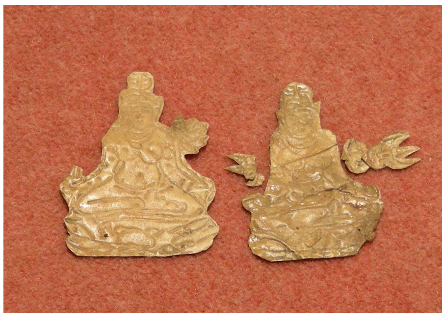
Figure 9. Images of goddesses, Chandi Bukit Batu Pahat, Malaysia. Bujang Valley Archaeological Museum, Pengkalan Bujang, Merbok, Malaysia.