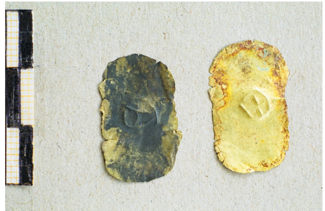
Figure 3. Gold leaves discovered at Go Thap.