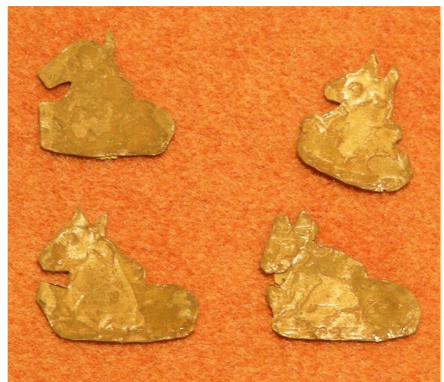
Figure 6. Images of bulls, Chandi Bukit Batu Pahat, Malaysia. Bujang Valley Archaeological Museum, Pengkalan Bujang, Merbok, Malaysia.