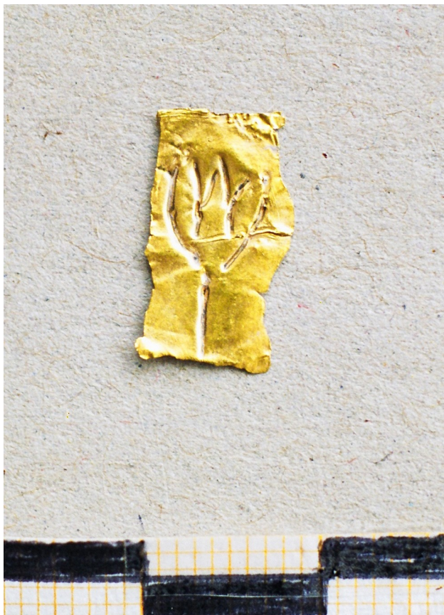
Figure 4. Gold leaves discovered at Go Thap.