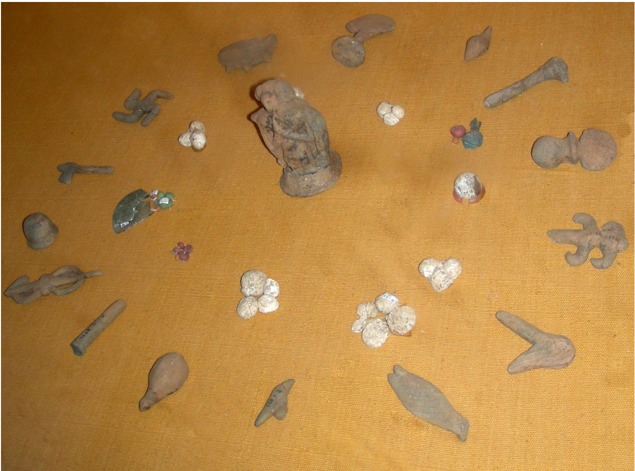
Figure 10. Auspicious symbols, miniature weapons and other items originating from a Buddhist monastery. Abhayagiri Museum, Anuradhapura, Sri Lanka.