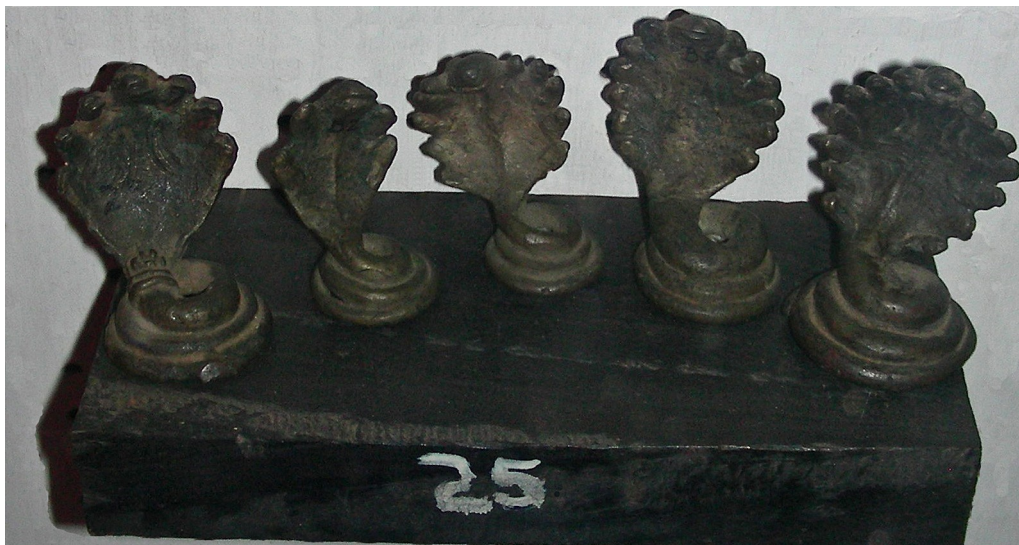
Figure 8. Bronze images of cobras. Anuradhapura Archaeological Museum, Anuradhapura, Sri Lanka.