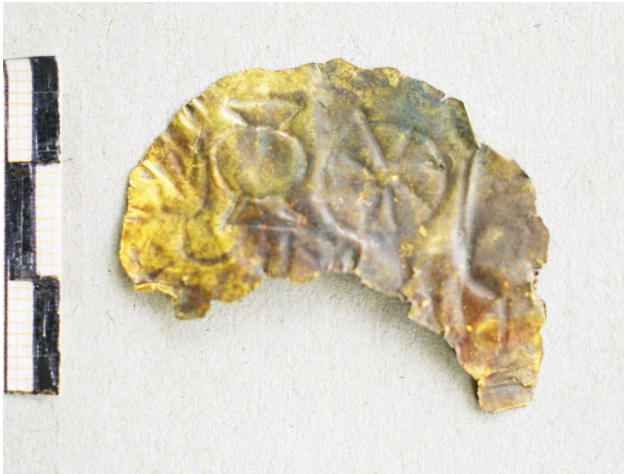
Figure 2. Gold leaves discovered at Go Thap.