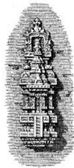
Figure 4. Preah Theat Kvan Pir, edifice representation. Line drawing. (After Parmentier 1927: Figure 64.)

Hoshino has identified place names other than Wendan with Si Thep (2002: 34, 41). Historical geographers who know the Chinese texts will have to review the evidence. It is not maintained here that the geographical information permits an identification of Si Thep as the capital of Wendan, only that Si Thep must have been a significant city in the polity.