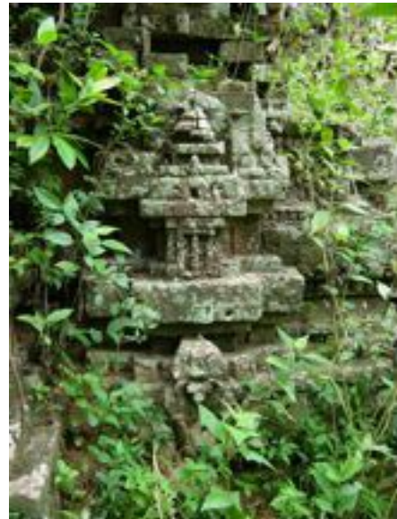
Figure 3. Trapeang Phong S2, detail of base.

relief carvings in Thamorat Cave, fifteen kilometers west of Si Thep. The presence of a central pillar, not a feature of other Buddhist cave sites in Thailand, indicates some knowledge of the plans of Chinese Buddhist cave sanctuaries (Brown 1996:87). More specific evidence is provided by a votive plaque fragment with the name of a Chinese monk inscribed on the back, which was discovered at Si Thep. A better preserved example is held by the Harvard University Museums (Brown 1996: Figure 52ab; Skilling 2009a: 121; Woodward 2010a: 156-57). These tablets are likely to be somewhat later in date than the stupa or the sculpture at the Norton Simon Museum, and therefore indicative of the presence of a Chinese visitor around the time of Wendan's major tribute missions to China, in 753 and 771.