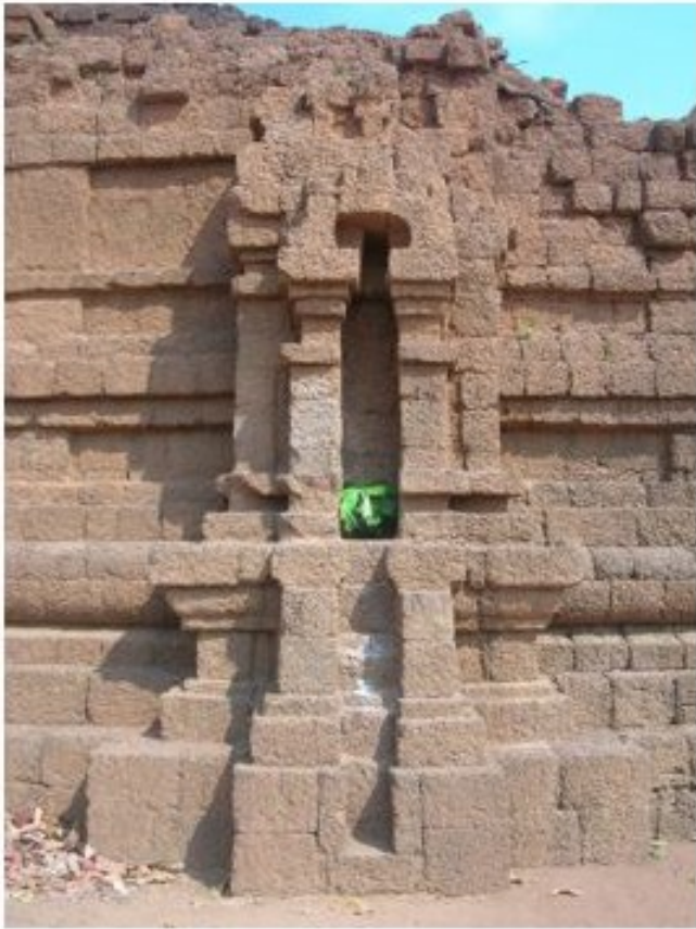
Figure 2. Khao Khlang Nok, Si Thep.