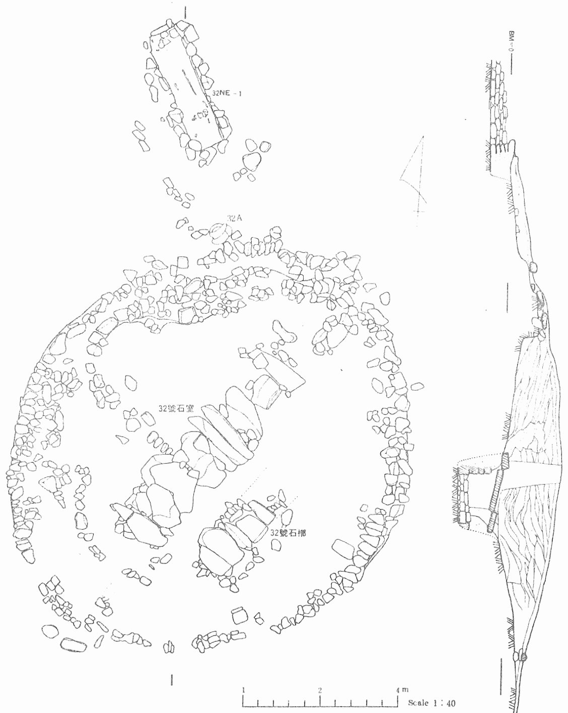
Figure 3. Plan and Section Drawings of Chisan-dong Tomb 32.