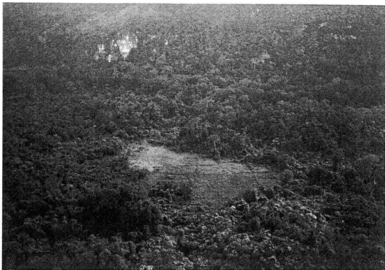
Figure 2. Aerial view of the agricultural system at Locality 2, facing southwest toward Phou Phakat, indicated by the exposed (white) limestone mass in the upper left corner of the photograph.

section, corresponding to Roger Duff's Type 2G (Duff 1970). The other tool was a bifacially ground axe, also lenticular in cross-section and lacking a distinct hafting device separate from the body of the tool. The bit was bevelled nearly symmetrically but had a decidedly asymmetrical curve to it. Ceramic items include fragments of mould-formed clay smoking pipes, which would postdate AD 1600 and may have been made in Laos itself (cf. Hein et al. 1992), low-fired earthenware sherds with friable sand-tempered paste, high-fired stonewares, and generally poor-quality porcelain "tradewares". Rather subjectively, the porcelains appear to represent the greater bulk of this assemblage; many also appear to be comparatively recent materials. Overall, however, the range of artifacts and the technology they represent im-