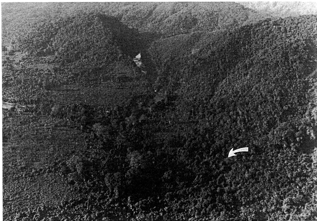
Figure 3. Aerial view of the terrain surrounding Locality 3 (indicated by the white arrow), facing northwest down the Houay Chalat drainage channel toward the Nam Kok seen in the background (upper central portion of the photograph).

Radiometric analysis of a single charcoal sample collected from a lens at the contact between the upper and lower A-Horizons yielded a C^{14} age of 340 \pm 80 years before present. This calibrates to a calendar age of AD 1470-1640 to the second standard deviation (cf. Stuiver and Kra 1986).