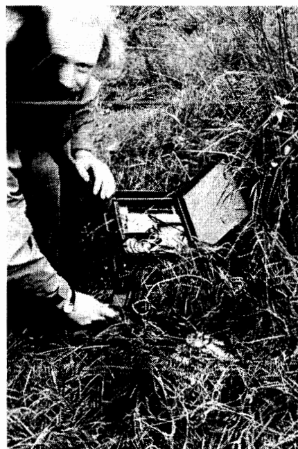
(b) Somerset County monitors ground conditions by observing ground water levels and, here, a county archaeologist takes physico-chemical measurements from ground probes.