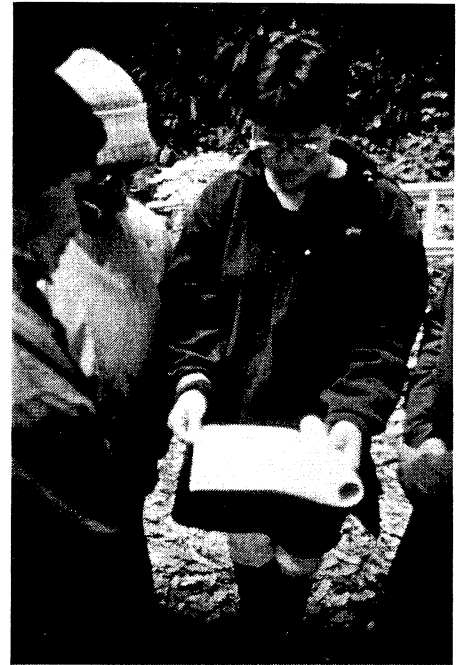
(a) A conservation planning consultant discusses the provisions of a plan with Maori kaitiaki (local guardians of site values whose ancestors once lived on the site), Te Koru Pa Historic Reserve, Taranaki, NZ.

... the CRM field has produced a whole generation of archaeologists who, while paying lip service to the conservation