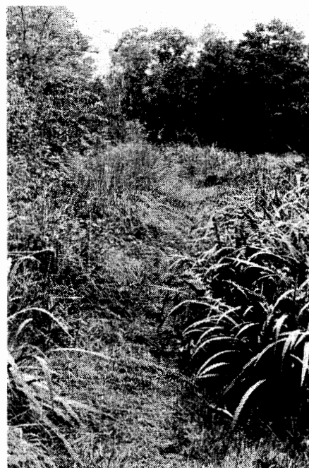
(a) The track line is maintained free of trees and the surface stabilised by grasses and sedges.

Possibly the best example of monitoring, albeit for an unusual purpose, is that conducted for the 1960s "experimental earthworks" in the UK. These have been intensively monitored in a wide range of ecological, biological and physico-chemical parameters at geometrically increasing intervals (Ashbee and Jewell 1998). The latest (the 32-year interval) was reported recently (Bell et al. 1996) and the