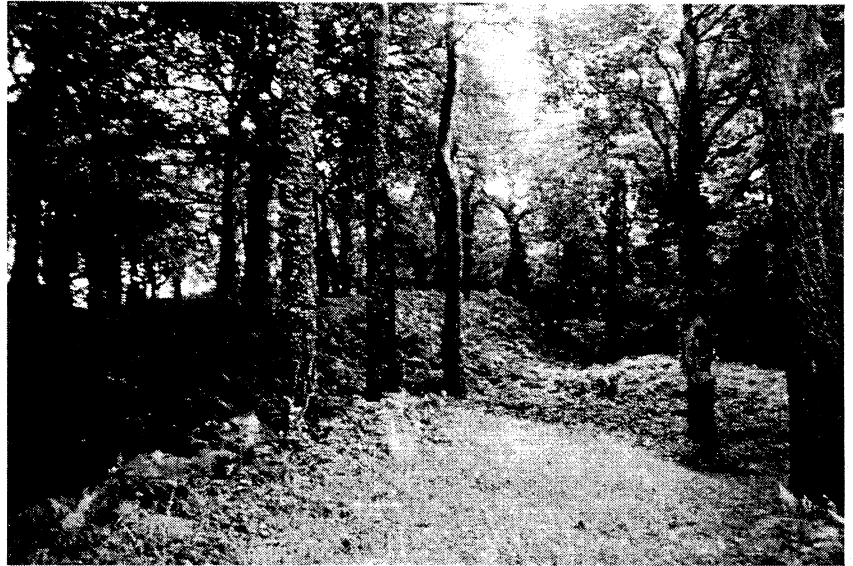
(a) Ground clearance in a 'gallery forest' at Blackbury (an Iron Age defensive earthwork), Devonshire, UK. Following an agreed management plan English Heritage selectively removes ground cover to reveal the earthwork features while still allowing for wildflowers, protective low-level ground cover and the protection of the tree canopy.