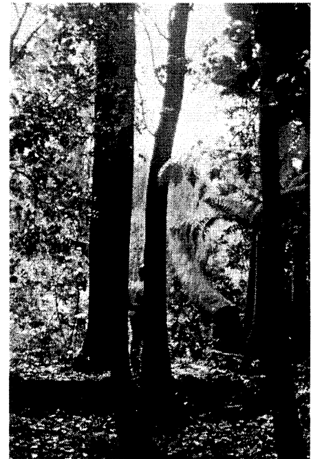
(b) Selective removal of destabilising trees from a revetted bank at Te Koru Pa, a Maori fortification some 300 years old, Taranaki, NZ. Elsewhere on the site, trees are planted or allowed to grow to maintain the protective canopy.