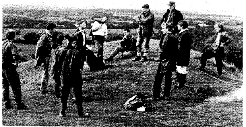
(b) On the chalk banks of the Roman Fortification of Hod Hill, Dorset, UK, various representatives from the National Trust, English Heritage, English Nature, local landowners and environmentalists discuss options for pasture management to achieve nature and archaeological conservation objectives.