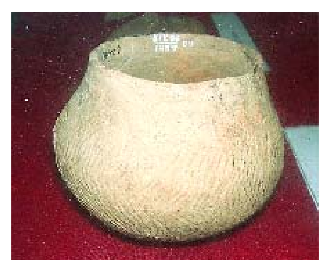
Figure 3. Dabutian-type vessel, Man Bac, Ninh Binh Province

In terms of subsistence, there were three Dabutian food strategies - exploiting molluscs (mainly Corbicula ) and mammals in swamp and lake environments (Da But, the lower layers of Con Co Ngua, Ban Thuy and maybe Dong Vuon); exploiting food resources in neighbouring mountainous environments (Lang Cong, Hang Sao, Hang Co); and fishing with nets and stone weights (Go Trung and the upper layers of Con Co Ngua). The second strategy was probably used on a seasonal basis only, at times when the food resources of swamps and lakes were minimal. In terms of the third strategy, the stone weights recovered from Go Trung and Con Co Ngua are the oldest in Vietnam. Several Hoabinhian sites yield fish bones