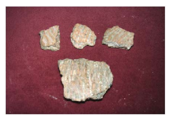
Figure 1. Pottery from Da But

ceramics have been reported to the south at Xom Tham in Quang Binh Province (e.g., sherd 32-94-214 in the Musée de l'Homme, perhaps a Dabutian potsherd, excavated by Colani in the cave of Xom Tham, Quang Binh Province). Even in some "Neolithic" sites of southern Guangdong (China), Dabutian potsherds have been documented. However, we can only confirm the real identity of such sherds with Dabutian examples after compositional analysis has been undertaken. In the evolution of Dabutian ceramic types, Bui Vinh has established two phases. The first has impressions of parallel unspun fibres, and only in the later phases does real cord marking occur, for instance in the upper layer of Go Trung (4700 uncal. BP; Nguyen and Nguyen 1979; Nguyen 1989; Bui 1991). Cord marking also occurs in the Lang Cong site, dated to 4900 uncal. BP (Bui 1992, 1993).