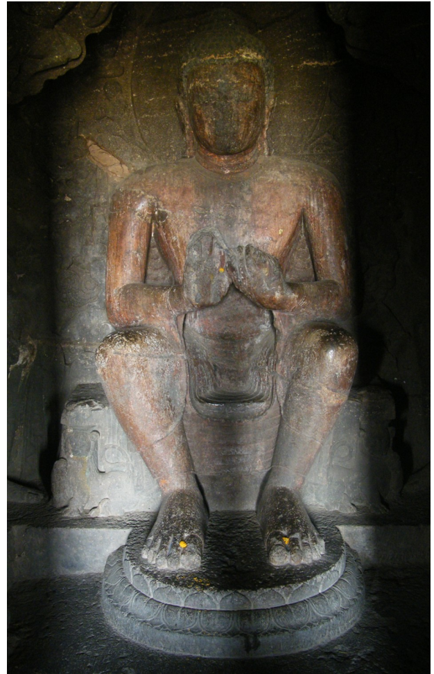
Figure 4. Pendant-Legged Buddha in dharmacakramudrā, High Relief, Stone, 6 th -7 th Century (?), Aurangābād, Cave 6, India