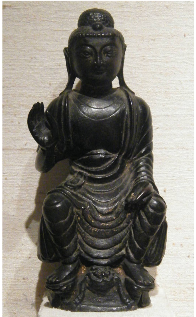
Figure 6. Pendant-Legged Buddha in abhayamudrā, Bronze, Tang Period Style, 7 th -8 th Century (?), Pacific Asia Museum, Pasadena, USA