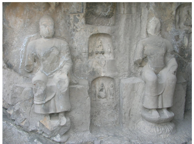
Figure 8: King Udayana Buddha Images, High Relief, Stone, 7 th Century, Longmen Caves, China