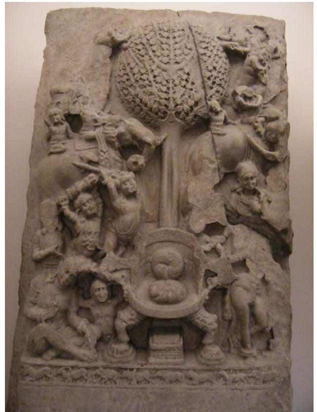
Figure 10. Empty Lion Throne with Buddha Footprints, Stone Slab, Amarāvati style, 2 nd Century C.E., Musée Guimet, Paris, France