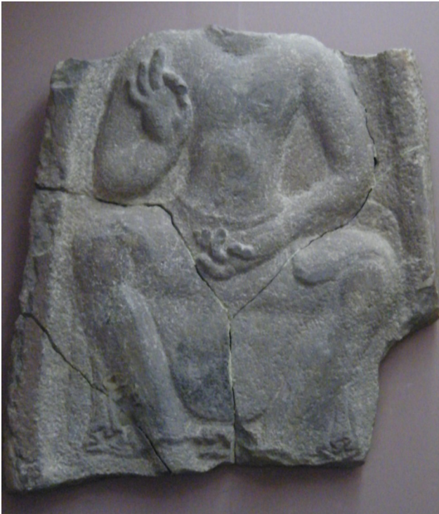
Figure 5. Pendant-Legged Buddha in vitarkamudrā, Low Relief Fragment, Stone, 7 th -8 th Century (?), Phimai National Museum, Thailand