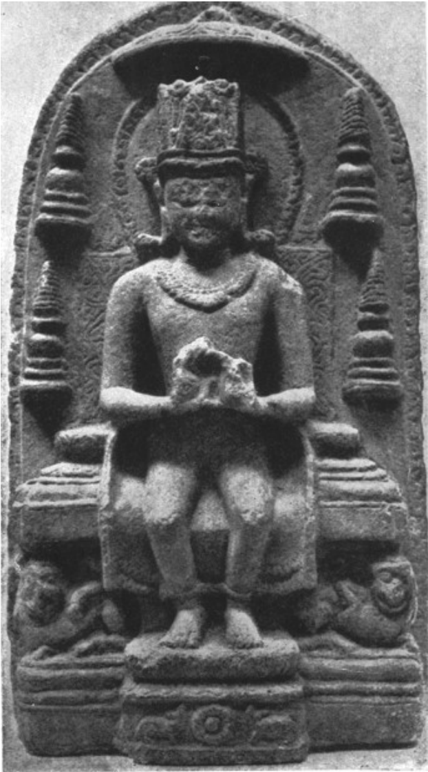
Figure 14. Crowned Buddha seated with Legs Pendant, High Relief, Stone, Pāla Period Style, 10 th -12 th Century (?), Boston Museum of Fine Arts, USA (Bourda 1949: 311 Figure 5)

able to trace, the earliest occurrence was probably penned by German Albert Grünwedel in his “Handbuch” entitled Buddhistische Kunst in Indien , first published in 1893. 17 This terminology – “à l’européenne” – was then taken over by Alfred Foucher (1894: 348) and given preeminence in his pioneering writings on Buddhist art (e.g. 1905: 49 n.1; 1909: 26 Plate 4).