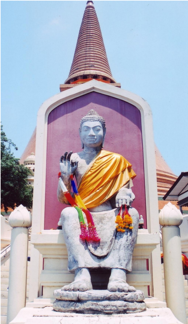
Figure 1. Pendant-Legged Buddha in vitarkamudrā , Stone, 7 th -8 th Century, Phra Pathom Chedi, Nakhon Pathom, Thailand

consideration the few extant models that seem to have reached the hands of private collectors, it is conceivable to assume that perhaps the diffusion of this iconography was once more important in the region. 8 As for Burma, only a few small bronze images and terracotta plaques seem to depict this iconography (Mya 1961, II: Plates 53-54; Luce 1985, II: Figure 76b; Moore 2007: 20-21, 164, 198, 222), while in Java, there are more examples, not only in bronze (Fontein 1990: 183-185; Woodward 1988: Figure 12) but also stone (Figure 3). 9 Is this iconography, however, unique to Southeast Asia?