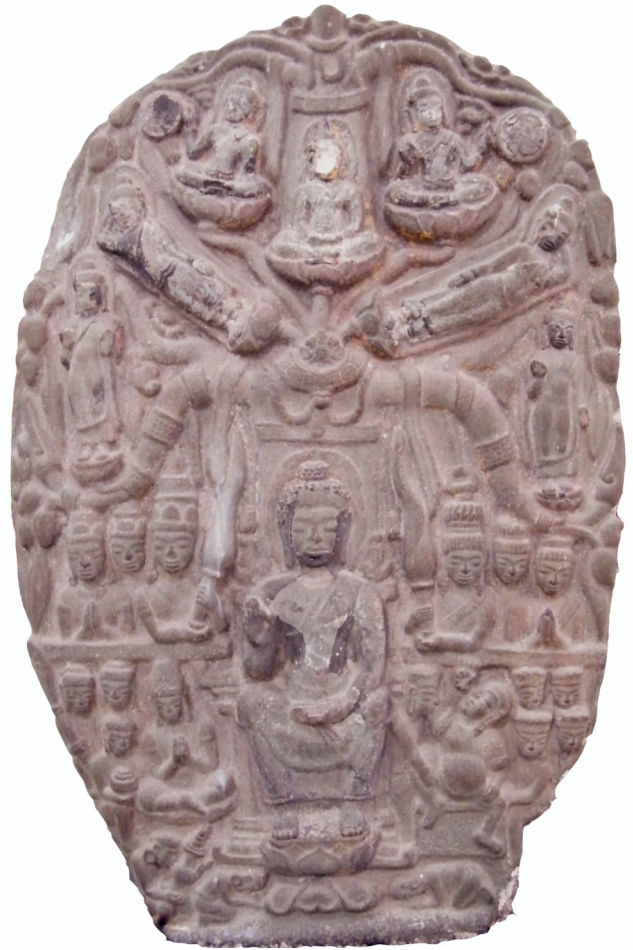
Figure 13. The Great Miracle at Śrāvastī, Low Relief, Stone, 7 th -8 th Century, Bangkok National Museum, Thailand