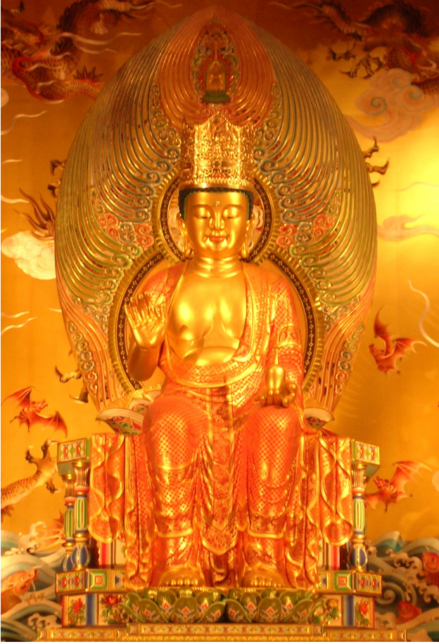
Figure 15: Pendant-Legged Buddha Maitreya with a Removable Crown and a Water Bottle, Copper Alloy, 21 st Century, Tooth Relic Temple, Singapore

identify the scene and the Buddha Śākyamuni as such but simply as “a king seated on a throne [and] speaking to an audience” (1895: 121; also Hennequin 2009: 138-139 Figures 2-3). Actually, this mode of sitting was already fairly common in Gandhāra in the time of the Kuṣāṇas and was not only allotted to kings (Figure 9) but to bodhisattvas and other divinities as well, perhaps echoing Greek and Parthian traditions (Rosenfield 1967: 186-188).