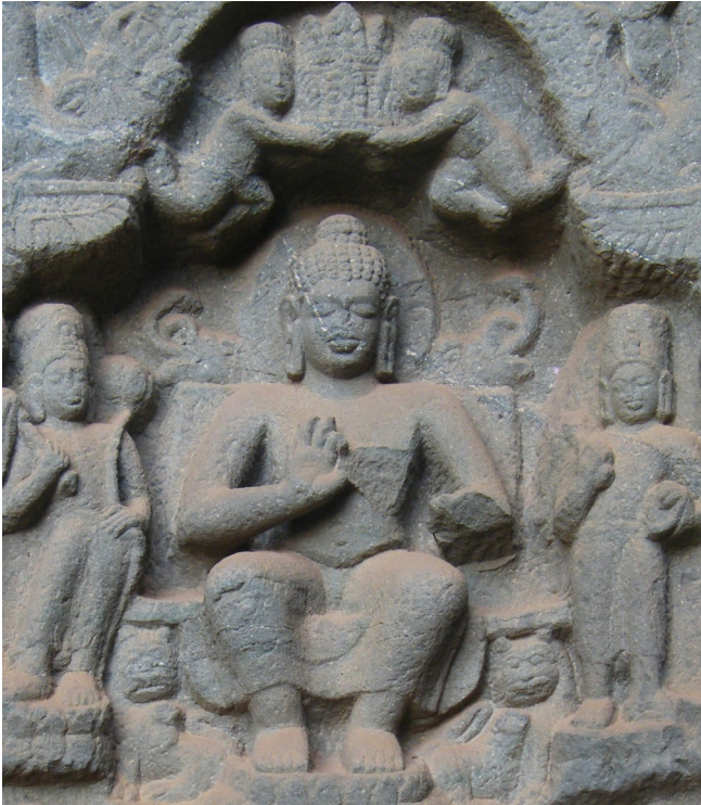
Figure 11. Enthroned Buddha (on Mount Meru?), Topped by Celestials carrying a Crown, High Relief, Stone, ca. 6 th Century, Karli (in situ), India