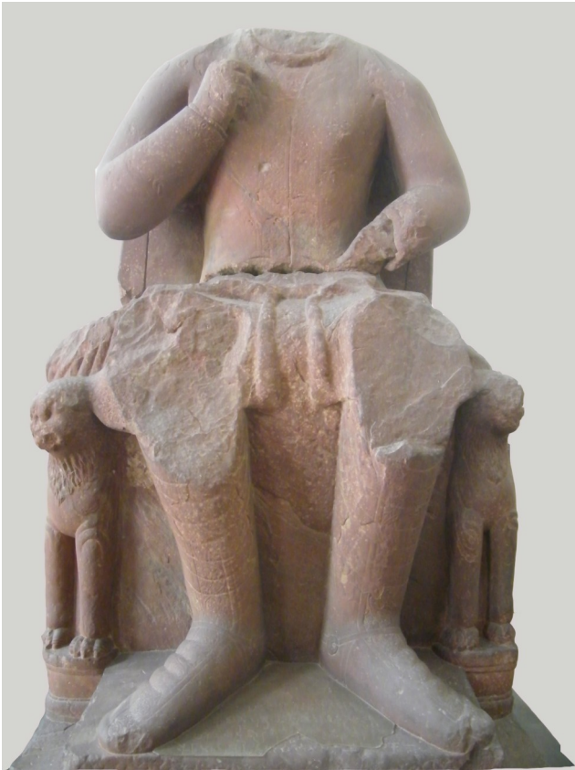
Figure 9. Kuṣāṇa Emperor (Vima Kadphises?) on a Throne, Stone, 1 st or 2 nd Century C.E., Mathurā Archaeological Museum, India