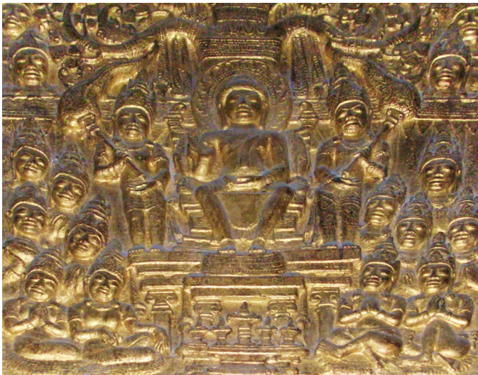
Figure 12. Enthroned Buddha in Trāyastriṃśa, Low Relief, Stone, 7 th -8 th Century, Wat Suthat, Bangkok, Thailand