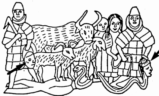
Figure 2 (continued). Head-hunting imagery in Shizhaishan art. Arrows point to head-hunting images.