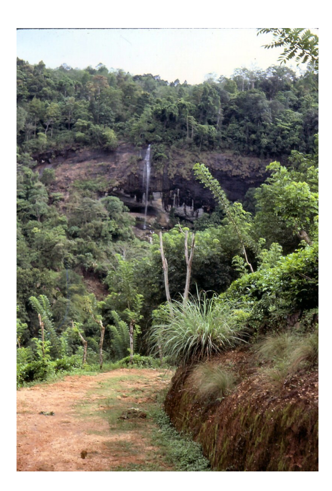
Figure 3. Fa Hien Cave at Pahiyangala (courtesy of Kenneth Kennedy).

In 1817-1818 the Vedda rallied with an upstart Sinhala insurrection led by Dorai Svami against the newly established British rule over the entire island, which had displaced the authority of the up-country Kandyan rulers. The rebellion crushed by the British military, eliminated the local aristocracy and Vedda influence. Following this, the Vedda groups declined throughout the 19th century. By the turn of the 20th century, they were considered to be on the verge of extinction (Seligmann and Seligmann 1911), or soon to be absorbed into the dominant Sinhala/ Tamil populations (Deraniyagala 1963; Dharmadasa and Samarasinghe 1990). In the mid-20th century Mahaweli River irrigation projects gave farmlands for the Sinhala population for expansion into the Vedda's life support regions. Where irrigation systems have been renovated and made available since the 1950s, thousands of Vedda have opted to resettle and engage in paddy cultivation and along with Sinhala farmers acquired land in the Mahaweli River plains.