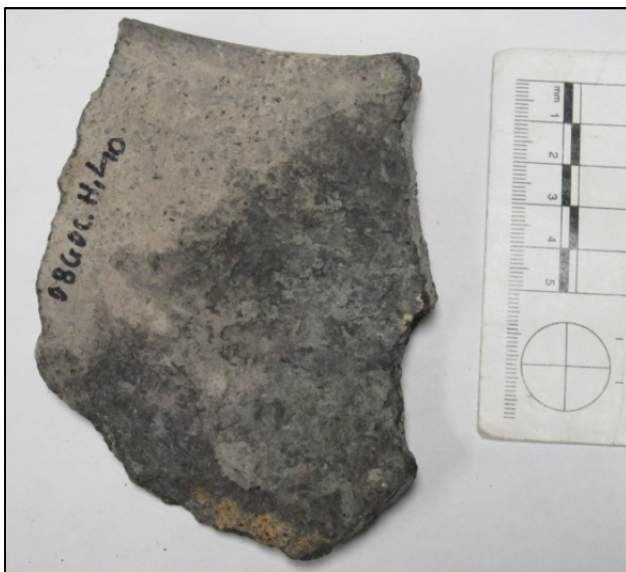
Figure 9: Pottery vessels from Gò Ô Chùa (top: Trench 2, Layer 11 and bottom: Trench 1, Layer 10) with non-abrasive surface attritions (pitting and surface erosions).

The majority of the vessels samples collected from Rạch Núi and An Sơn sites have cord marked exterior surfaces, while plain vessels dominate those from Gò Ô Chùa site. Aside from aesthetic purposes, texturing via cord marking, stamping, and impressing could have been intended to make the pottery vessels easier to handle, more durable (longer use-life), and/or more effective for cooking (Pierce 2005). Burnishing or coating was done to increase the resistance of the vessels to abrasion and decrease their permeability (Skibo et al. 1997).