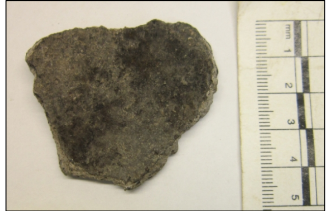
Figure 6: A body sherd from Gò Ô Chùa, Trench 1, Layer 10.

can be attested by the samples identified as restricted pots, jars, and restricted pots/jars from An Son and Gò Ô Chùa sites. Other temper materials (sand, grog, shell, lime, and limestone) could have also been used for improving the workability of the clay and thermal shock resistance of pottery (after Bronitsky and Hamer 1986; Rye 1976).