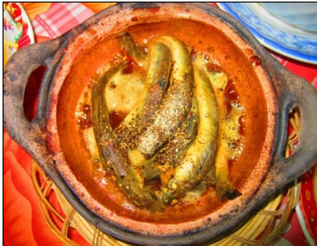
Figure 4: Clay pot used to serve Cá Kho Tộ or braised caramelized fish in Phong An restaurant.

Vietnam underwent the extraction process for lipid residues and were analyzed with gas chromatography-mass spectrometry (GC-MS) as fatty acid methyl esters (FAMES). The archaeological samples are two rim sherds from Rạch Núi site, two body sherds from An Sơn site, and a shoulder and body sherd from Gò Ô Chùa site. Detailed methods on technofunctional and organic residue analyses are found in Supplementary Materials I and II, respectively.