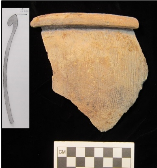
Figure 5: An example of restricted pot from Gò Ô Chùa, Trench 2, Layer 11.

surface attritions (pitting and surface erosions, after Vukovic 2012). Only two vessel samples have presence of soot due to cooking activities. One is a body sherd from Gò Ô Chùa with charred interior surface residues (Figure 6), which are possibly burnt food remains. Another consists of fragments of a stove from An Son with charred interior surface residues (Figure 7), which are possibly due to firewood used for cooking. Many samples have firing clouds that could be due to cooking activities and/or firing of pottery (Figure 8). Pedestalled tempers are commonly found in samples with organic and lime tempering materials. The non-abrasive surface attritions (pitting and surface erosions, after Vukovic 2012, Figure 9) were observed from the interior surfaces of two samples from Rạch Núi, two from An Son, and four from Gò Ô Chùa. This could possibly be due to a fermentation process (Vukovic 2012). It is possible that the sherd samples with eroded interior surfaces came from vessels used to prepare and/or serve fermented food items, similar to the making of fish sauce by fermenting fish and salt in present-day Vietnam.