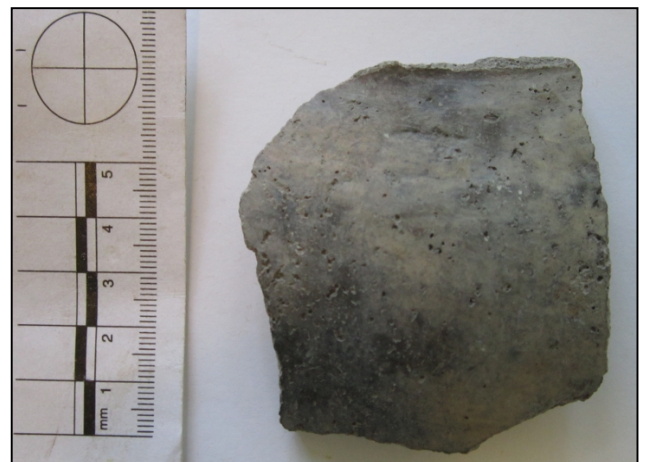
Figure 8: A pottery sherd from Gò Ô Chùa, Trench 1, Layer 11 with firing cloud.