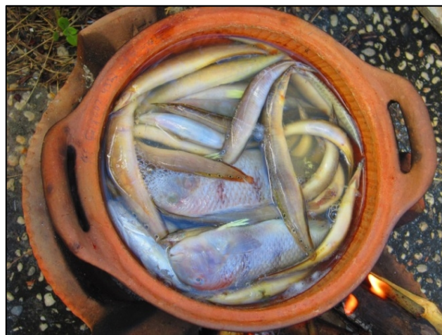
Figure 2: Boiling a variety of freshwater fish in the experimental cooking pot (E7).

to cook by boiling five varieties of fish (Figure 2, Suppl. Fig. S2). The second pot was used to cook two dishes (Suppl. Fig. S3). The third pot was used to cook different varieties of fish by frying and boiling (Figure 3, Suppl. Fig. S3). Since there are restaurants in Southern Vietnam that use earthenware pots to prepare and serve some traditional dishes, we took an opportunity to collect the clay pot used to serve Cá Kho Tộ or braised caramelized fish in Phong An restaurant (Figure 4, Suppl. Fig. S4). We also interviewed the owner of a Thuy Ta restaurant about the use of clay pots in preparation and serving of food, consequently leading to the collection of another pot used to serve Cá Kho Tộ (Suppl. Fig. S4). The interview is part of the ethnoarchaeological survey on the food related activities of people using earthenware ceramics with approval from Institutional Review Board (Protocol #2012-U-1089).