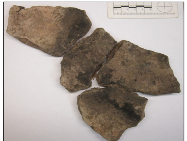
Figure 7: A stove from An Son, Trench 1, Layer 10 with charred interior surface residues.