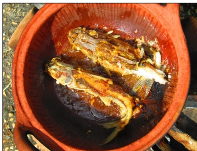
Figure 3: Frying fish in the third pot used for frying and boiling.

The archaeological pottery samples were documented with technofunctional analysis. The experimental pot used for cooking several types of freshwater fish caught from the tributaries of Mekong River system, two ethnographic pots, and six archaeological samples from Southern