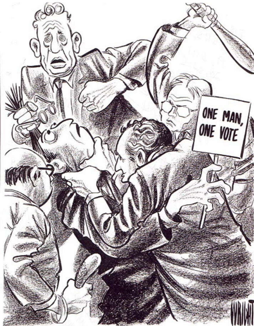
"We Must Be Selective About Those Who Elect Us"