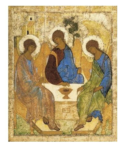
Figure 2. Rublev's Icon.

What the Chancay figurine and the Russian icon have in common is that both are products of an understanding of the world far different from the standing-reserve. Dreyfus (1993, 295) contrasts the Styrofoam cup with a traditional Japanese teacup. Both are products of how the surrounding world is understood. The Styrofoam cup is the logical result of a view of the world as resources to be used and discarded when they are finished serving their purpose, while the Japanese teacup arises from a different view of the world. But the difference is more profound and cuts to the core of being: "the practices containing an understanding of what it is to be a human being, those containing an interpretation of what it is to be a thing, and those defining society fit together." In other words, the social practices of using Styrofoam both feed off of and feed into a society that views other people as standing-reserve. The Styrofoam is symbolic of a certain social knowledge, just as the figurine, the icon, the Japanese teacup, and the "blue-dollar" hawk are social knowledge. Organizing this social knowledge may be the most difficult part of knowledge organization, given the high level at which this knowledge exists (Rafferty 2019, 7), but it may also be the most important task of